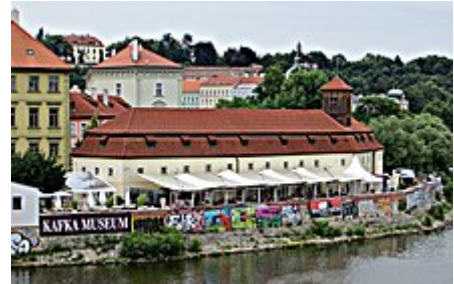
The museum's exterior in 2015